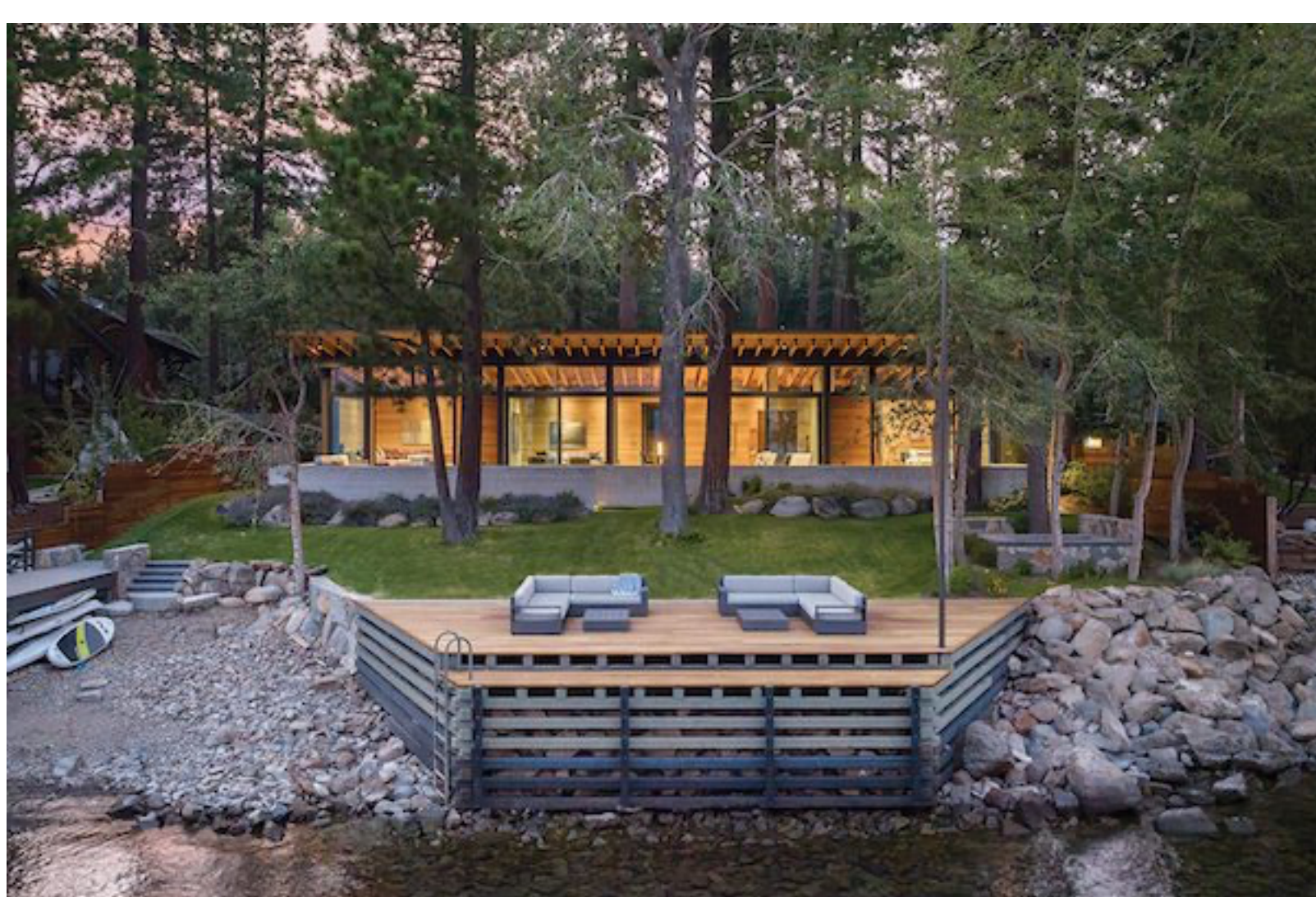
AN ELEVATED VIEW OF THE 84-FOOT-WIDE HOME FROM THE SHORELINE OF LAKE TAHOE SHOWCASES THE EXPANSIVE GLASS WALLS AND INTERIOR FINISHES