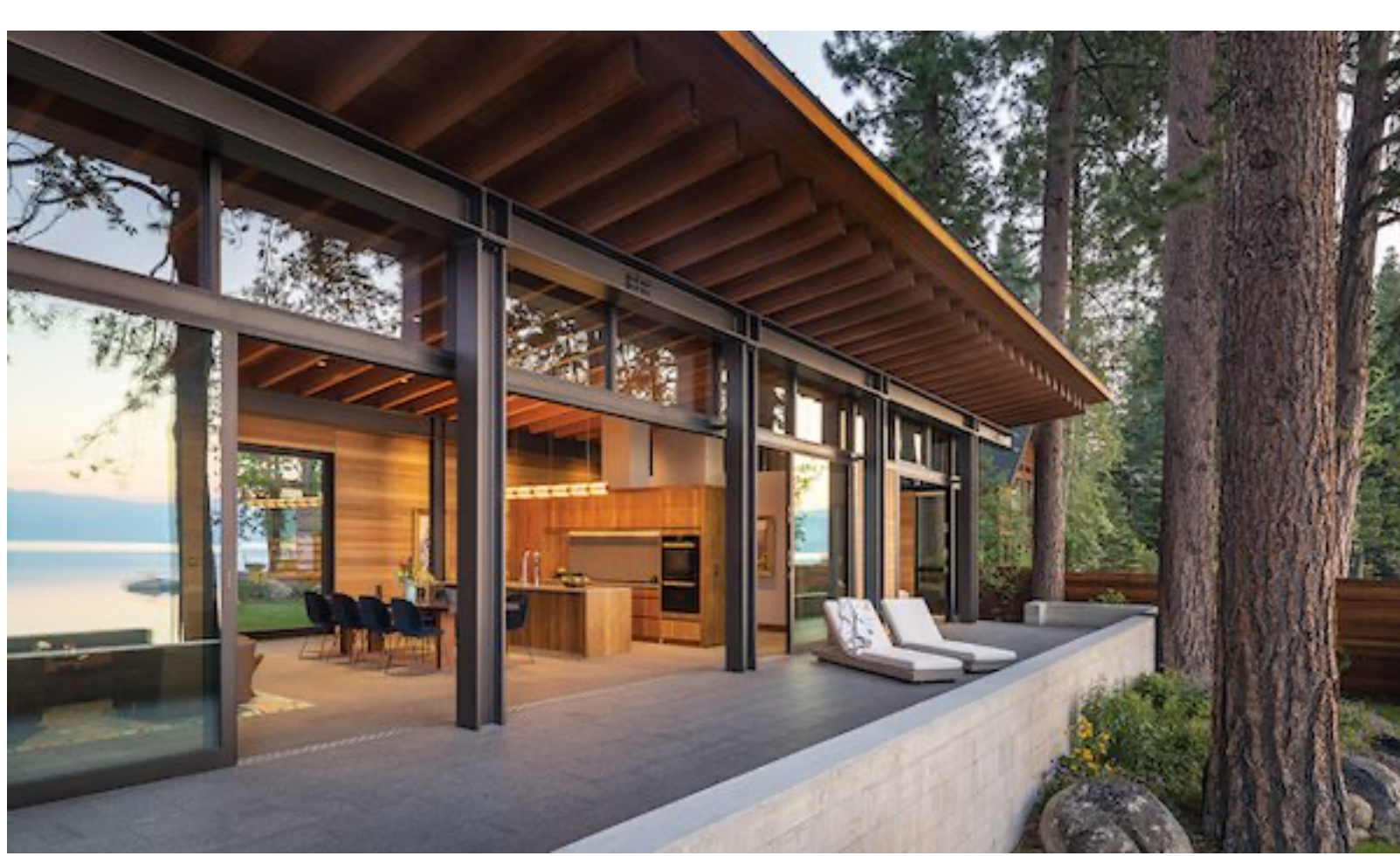
THE OFFICE HAS CUSTOM SCRAPED WALNUT FLOORS ALONG WITH T&G KNOTTY CEDAR CEILINGS TO PROVIDE THE ROOM WITH SOME WARMTH