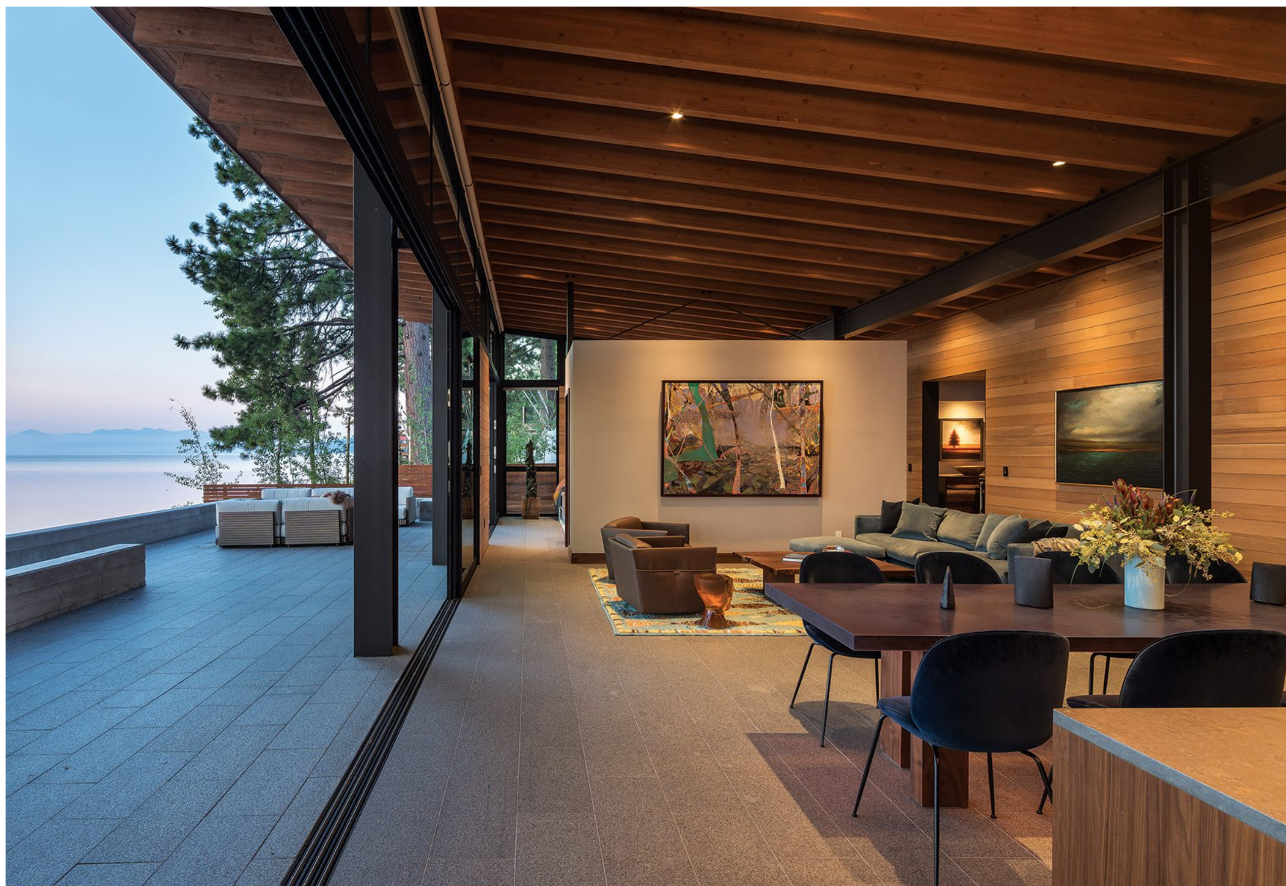
THE 38-FOOT-WIDE SLIDING GLASS WALL WITH FLUSH TRANSITION PROVIDES A SEAMLESS INDOOR-OUTDOOR CONNECTION