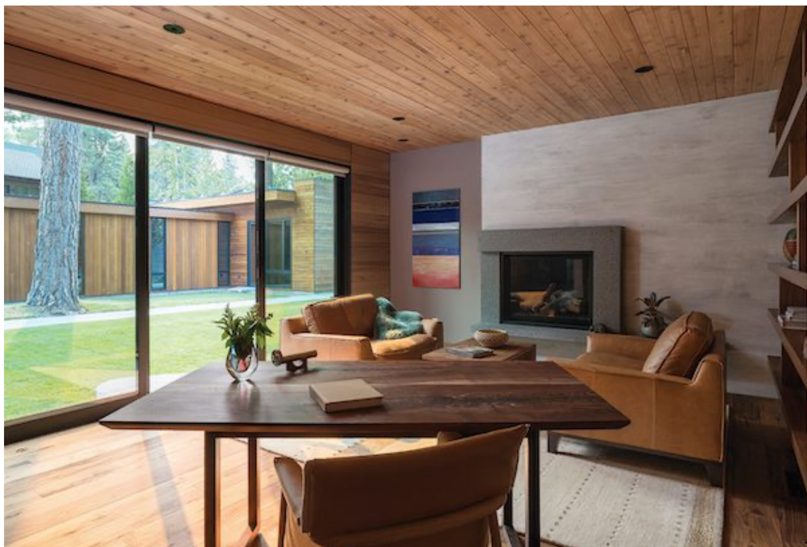
THE OFFICE HAS CUSTOM SCRAPED WALNUT FLOORS ALONG WITH T&G KNOTTY CEDAR CEILINGS TO PROVIDE THE ROOM WITH SOME WARMTH

Paul notes that they took great pains to build around the existing trees without disturbing them.