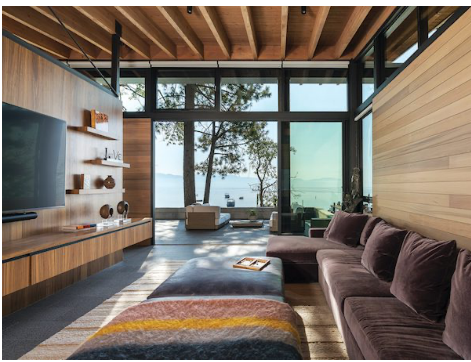
THE BUILT-UP ROOF WAS CONSTRUCTED USING CLEAR SPAN RE-SAWN RAFTERS THAT ARE SITTING ON HEAVY GAUGE STEEL BEAMS SPANNING 24 FEET. INSTALLED BY VERTICAL IRON WORKS, THE STEEL STRUCTURE SUPPORTS THE ROOF LOAD AND ALLOWS THE LARGE SLIDING GLASS DOOR OPENING