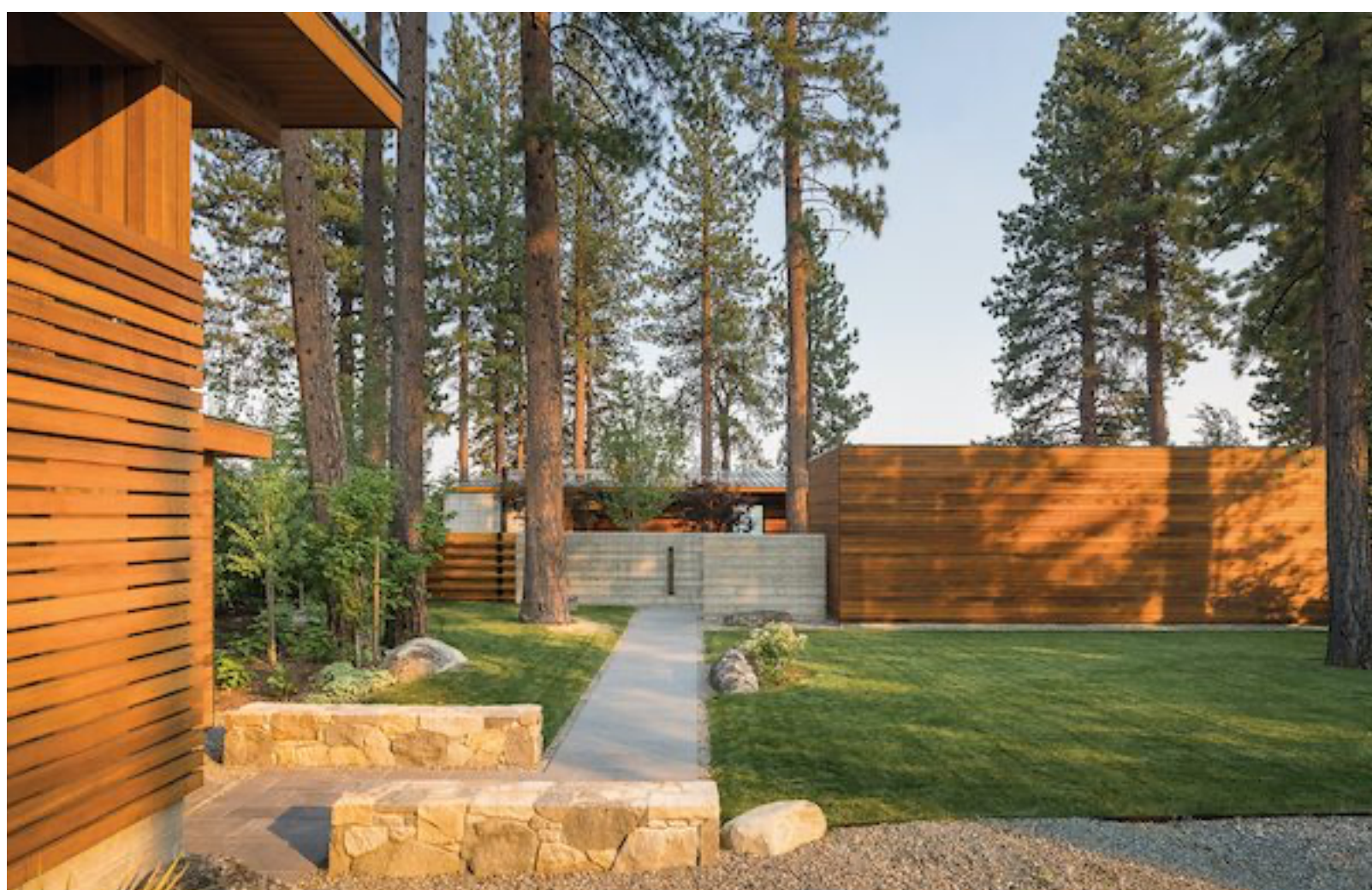
THE RADIANT-HEATED WALKWAY ASSURES YEAR-ROUND ACCESS GOING FROM THE DETACHED GARAGE TO THE MAIN HOUSE. THE WALKWAY LEADS TO AN INTERIOR COURTYARD SEPARATED BY TWO 7-FOOT-TALL BOARD-FORMED CONCRETE WALLS

Interestingly, a utility easement running through the lot created two separate design areas, with the garage building near the road and the residence near the lakefront.